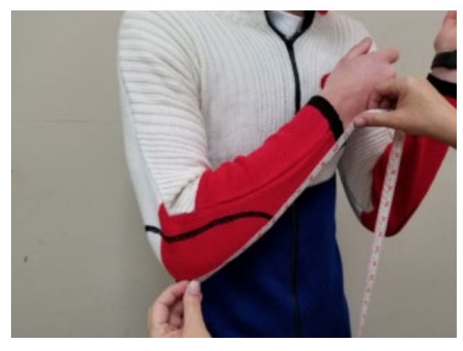
167 Creedmoor Way Anniston, AL 36205

Measure from the point of your elbow to your wrist bone.